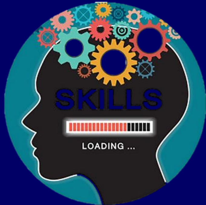
REQUIRE SKILLS. WORK EXPERIENCE