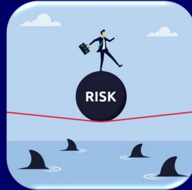
ABILITY TO TAKE RISKS