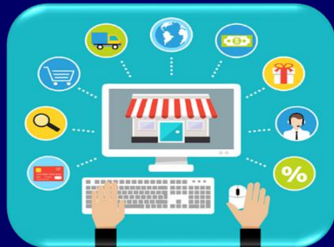
OWN BIG BUSINESS

“All our Dreams can come true, if we have the Courage to pursue them”